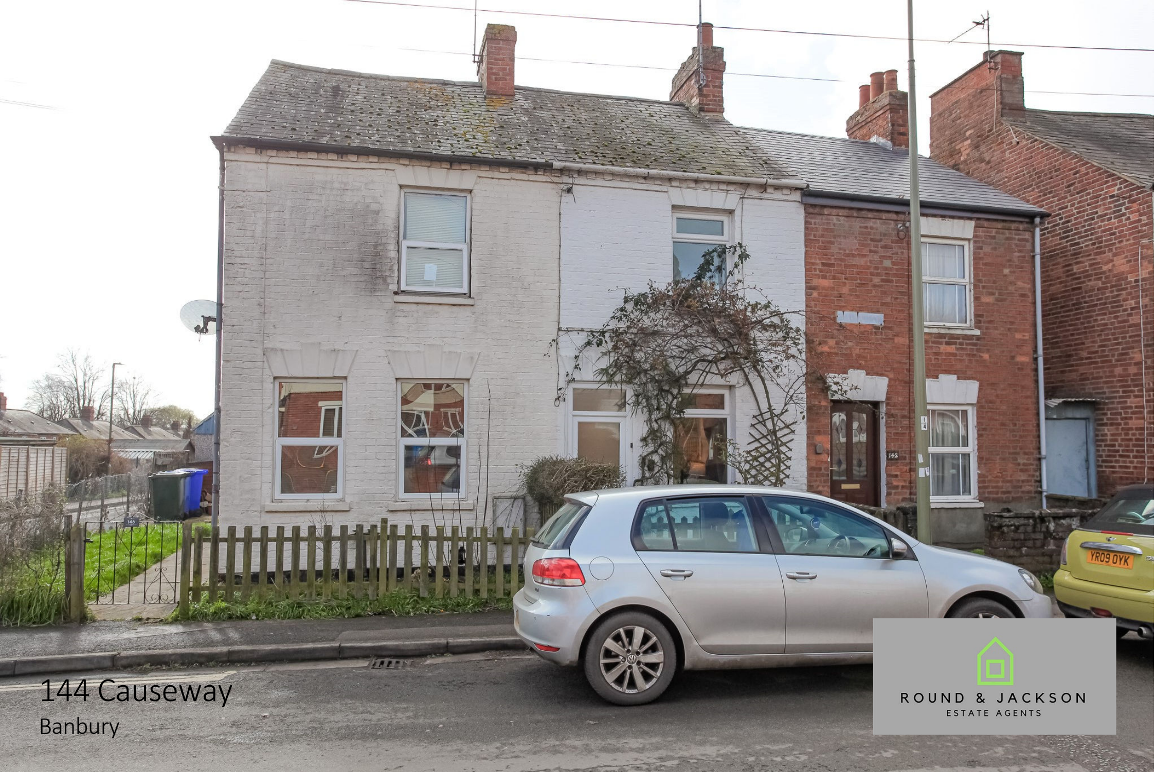
144 Causeway Banbury